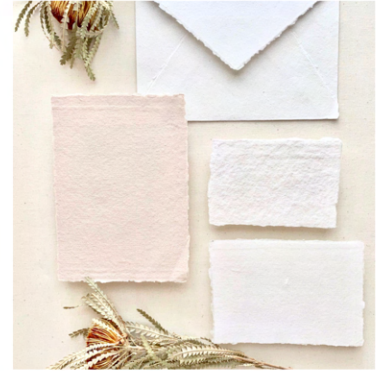
DECKLED EDGE HAND-MADE PAPER