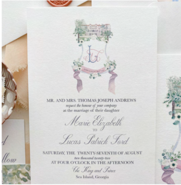
STANDARD 120LB EGGSHELL ULTRA WHITE

We source the best paper for your wedding suite. These are a few of our most common paper options: