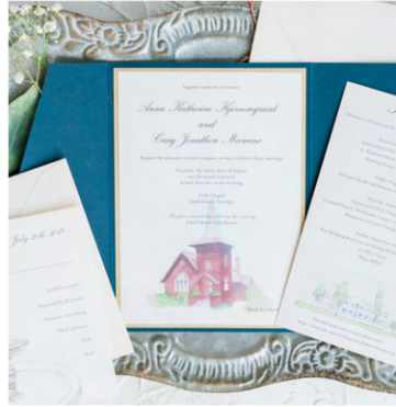
DOUBLE THICK 240LB EGGSHELL ULTRA WHITE